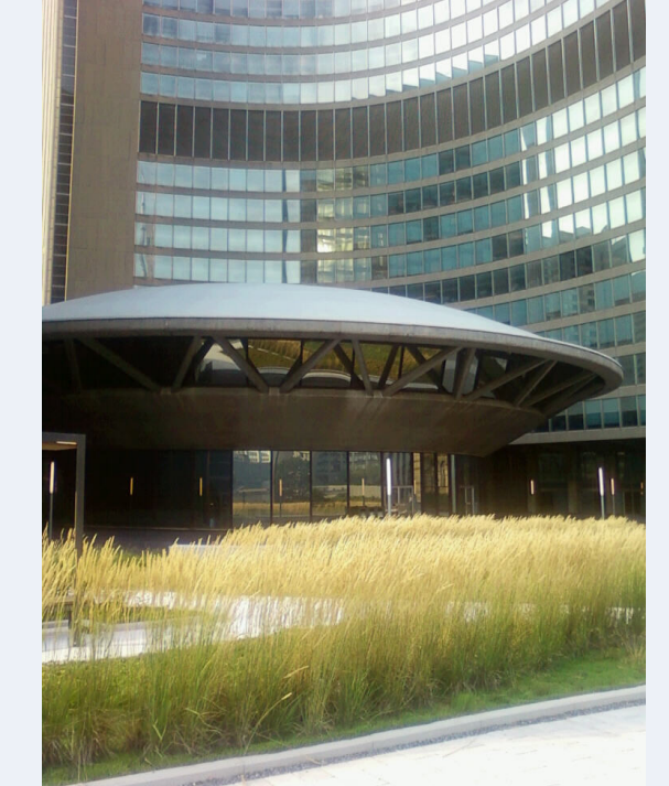
Toronto's new public gardens and green space on the rooftop at city hall

Safety and sustainability can become part of our civic DNA if we learn how to make it part of the CPTED and SafeGrowth message.