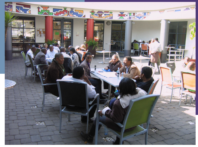
Public spaces and safety workshopping in Pretoria, South Africa