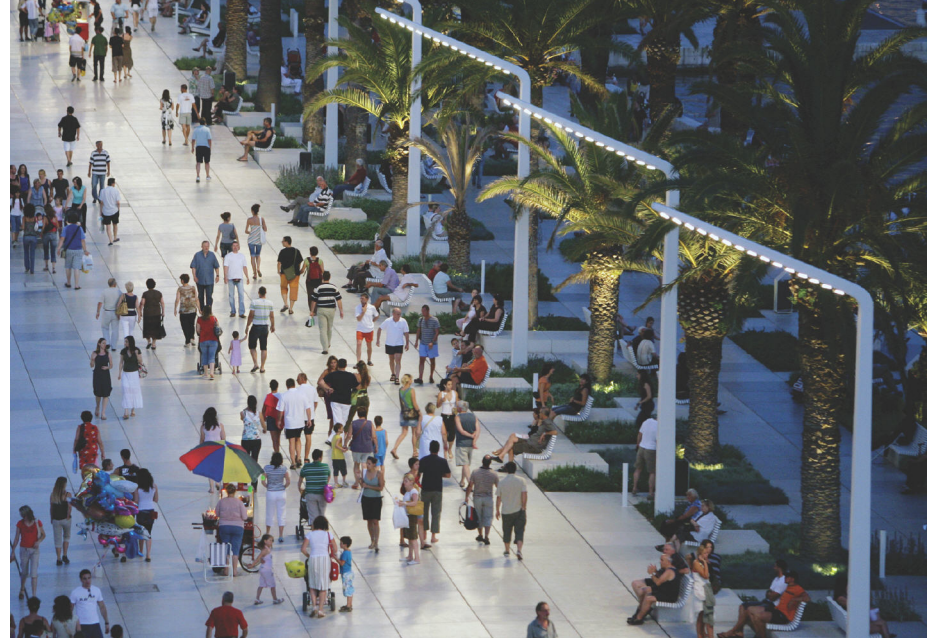
New LED technology lighitng public walkways